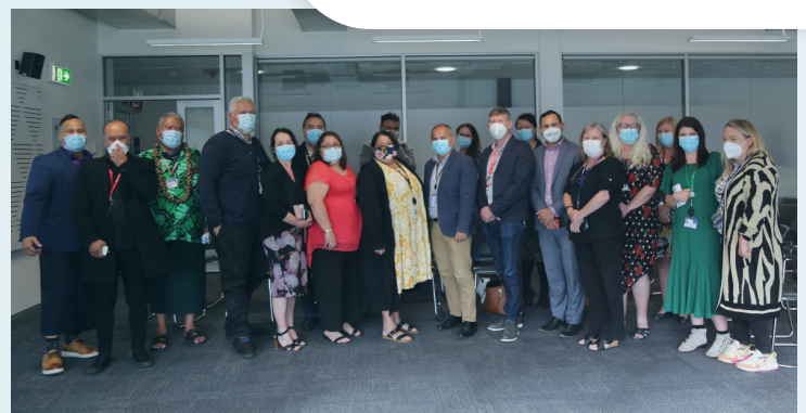
Mihi whakatau hosted by Counties Manukau to launch the IPS expansion and welcome new employment consultants (April 2022)

Mahitahi Trust It's in our nature to welcome you People together nurturing wellness